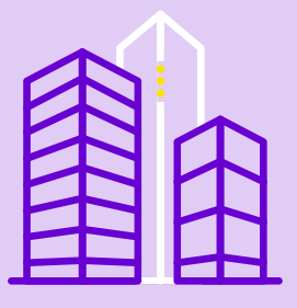
Accredited provider across a number of public sector purchasing frameworks.

Gamma has earned advanced specialisation in Calling for Microsoft Teams. This certification recognises Microsoft partners with deep knowledge, extensive experience, and proven customer success.